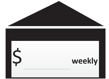
Household Rent Amount

Use the Household Map to discuss and record details for people living in and visiting the home